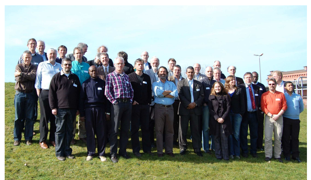
Photo: Participants of the Flyway Workshop in Wilhelmshaven on 22 - 23 March 2011

The workshop brought together the collective expertise on the flyway management and reinforced the expert network along the flyway, and deepened the understanding of the challenges and opportunities ahead. The workshop recommended to develop a clear vision on how the request of the World Heritage Committee should be interpreted and implemented and to appoint the CWSS as the coordinating and implementing body with support from the trilateral bird monitoring groups (JMMB, JMBB). Further it was recommended to develop an integrated training and capacity building programme based on the flyway approach and improve site management and wise use. Finally the development of an integrated monitoring programme was strongly recommended in conjunction with associated research. The workshop and other reports and presentations are at <a href="http://www.waddensea-secretariat.org/news/symposia/flyway_2011/workshop.html">http://www.waddensea-secretariat.org/news/symposia/flyway_2011/workshop.html</a>.