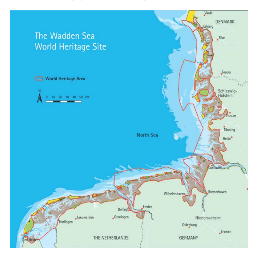
1.2. Overview Map (size 5 x 5 cm)